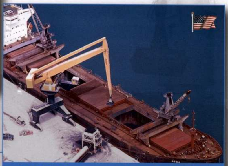
2000 Series : 18450 CR-D