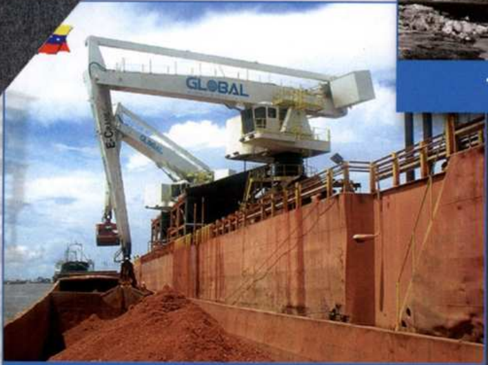
1500 Series : 11264 PD-E