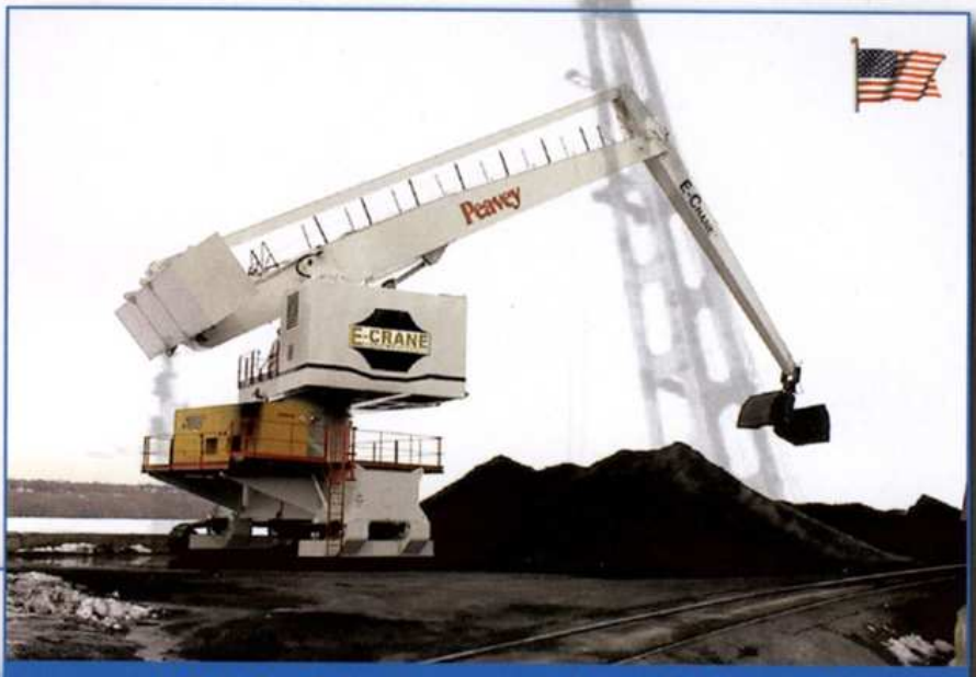
1000 Series : 7264 CR-D