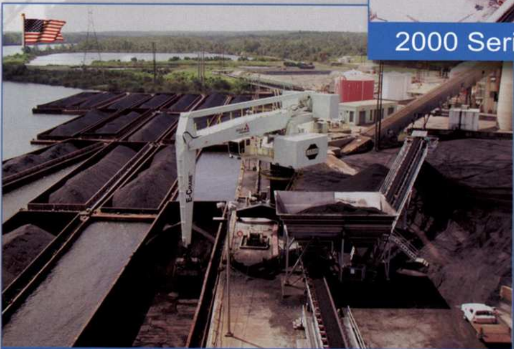
2000 Series : 18264 PD-E